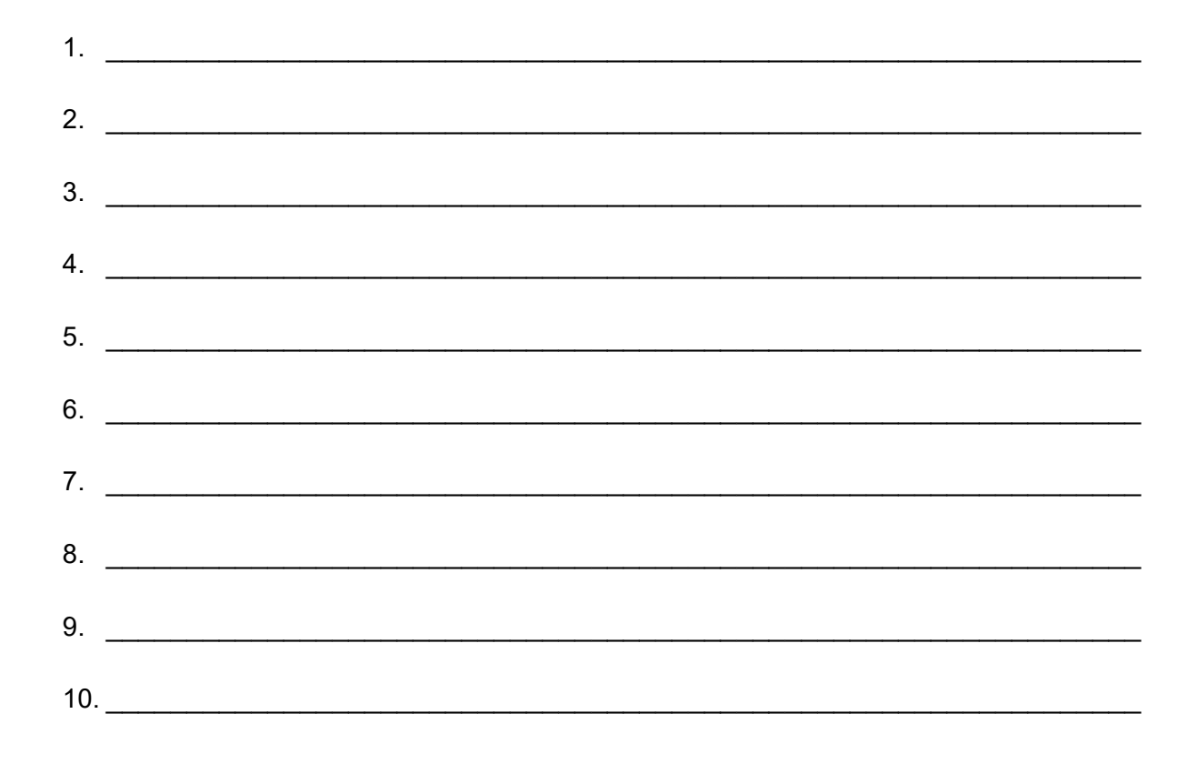
Exhibit notebooks must be submitted by 12:00 p.m. one court day before trial. The Exhibit Notebook Certification must accompany exhibits submitted to the Court.

List the exhibits that you plan to submit in support of your case at your hearing. Exhibits may include documents (such as letters, receipts, etc.) or other physical evidence (such as photographs, drawings, etc.). You do not need to send the exhibits at this time, just list them.